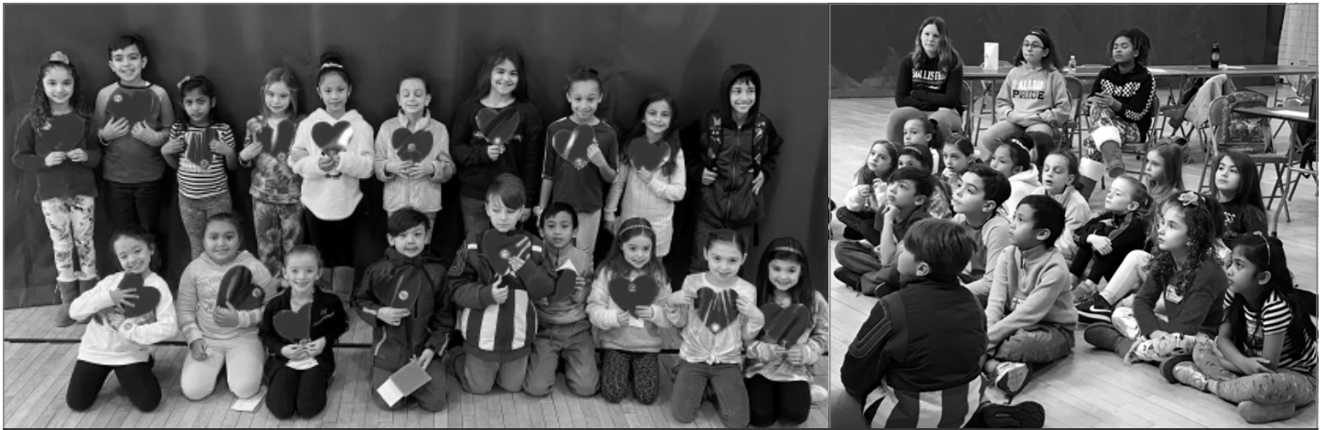
Grade 2 students at their First Reconciliation Retreat on January 18th