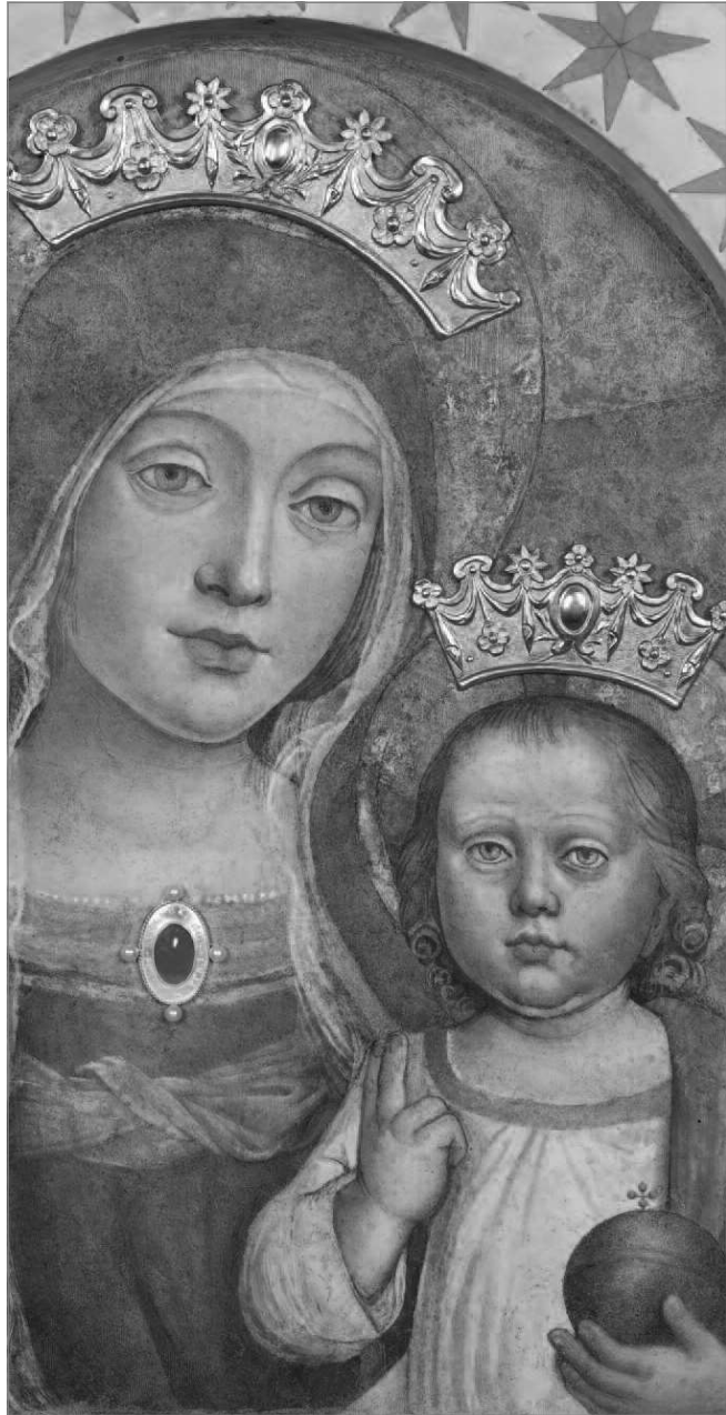
The ancient fresco of Madonna del Soccorso (Our Lady of Help) in St. Peter's Basilica was restored with the support of the Knights of Columbus to mark the Year of Faith (2012-2013).