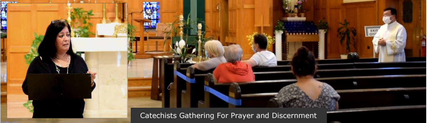
Catechists Gathering For Prayer and Discernment