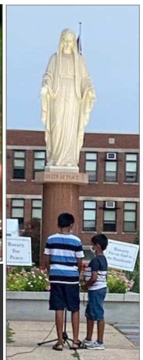
The Daughters of Mary met for their first meeting of the year on the front lawn of the Church on September 13th. Plans for the upcoming year were discussed. The girls took time to play a few games before ending the meeting with the recitation of the Rosary. (above)