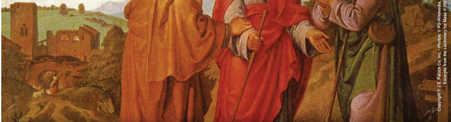
Copyright © J.S. Paluch Co. Inc. - Photos: © PD-Wikimedia, Joseph von Führich: Der Gang nach Emmaus Excerpts from the Lectionary for Mass © 2001, 1998, 1997, 1986, 1970, CCD.

When the two disciples returned from Emmaus, they recounted what had taken place on the way.